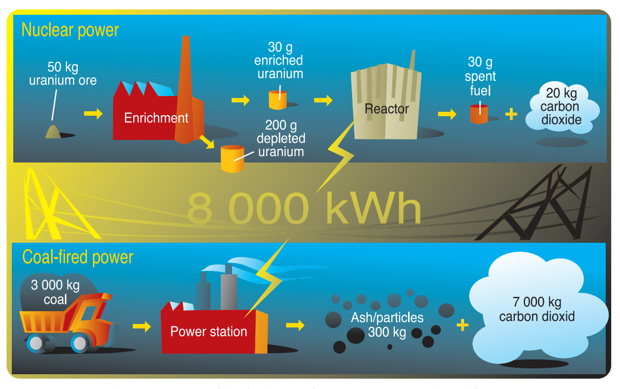
Important parts of the fuel cycles for nuclear power and coal-fired power

- Uranium - a sustainable energy source -